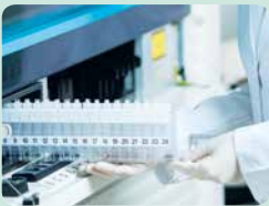
Automated DNA extraction system