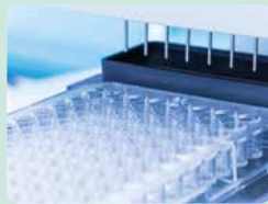
Liquid handling system