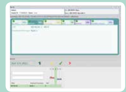
HISTO MATCH Software

What BAG Health Care can offer to you directly: